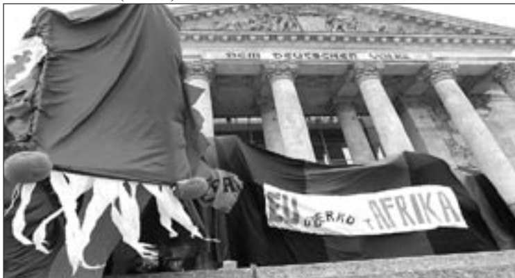
The Patent-Dragon shows the effects of patent law and EPAs...

ence Corporations for whom the bureaucratic effort will increase a little but who further on will look like the good guys, because they are going to share a pittance of their profits? The countries of the south which can claim a fee for giving access to genetic and biological resources of their territory? Indigenous commu-